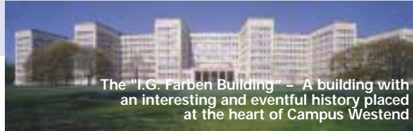
The "I.G. Farben Building" – A building with an interesting and eventful history placed at the heart of Campus Westend

A great space for great thoughts: the beautiful campus offers extraordinary conditions for studying and research. The following departments can be found here: