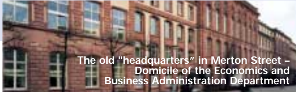
The old "headquarters" in Merton Street – Domicile of the Economics and Business Administration Department

Frankfurt University is located on four main campuses.