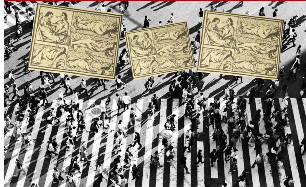
Codex Florentinus (1577) [Biblioteca Medicea Laurenziana, Firenze]