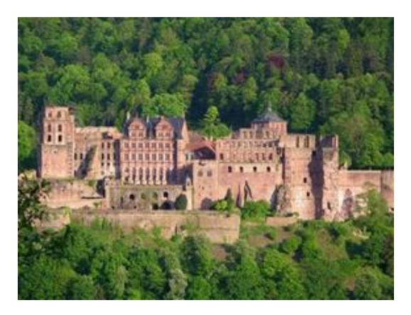
Option B: Bus Tour and Castle Stroll

This option includes a bus tour around the city visiting both sides of the river Neckar, including the new university campus ,and ends with a visit to Heidelberg Castle & the Castle Gardens (optional stops: German Pharmacy Museum; Great Barrell, etc.)