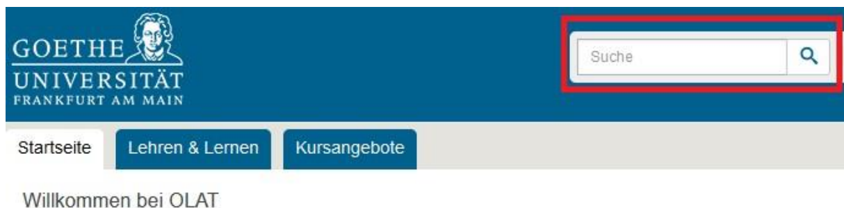
Fig. 1, OLAT search function

Optional modules are administered via the OLAT-course “BA American Studies – Optional Modules.” This course provides students with all relevant information concerning eligible activities, guidelines on the Credit Points (CP) awarded as well as the required documentation. Additionally, the OLAT-forms “Academic Optional Module – BA American Studies – Requirements” and “Practice-Based Optional Module – BA American Studies – Requirements” guide students through the process of submitting the relevant documentation of their activities. Students are encouraged to enrol in this OLAT-course early during their studies in order to familiarize themselves with the requirements of both optional modules. Students can find the course using OLAT’s search function.