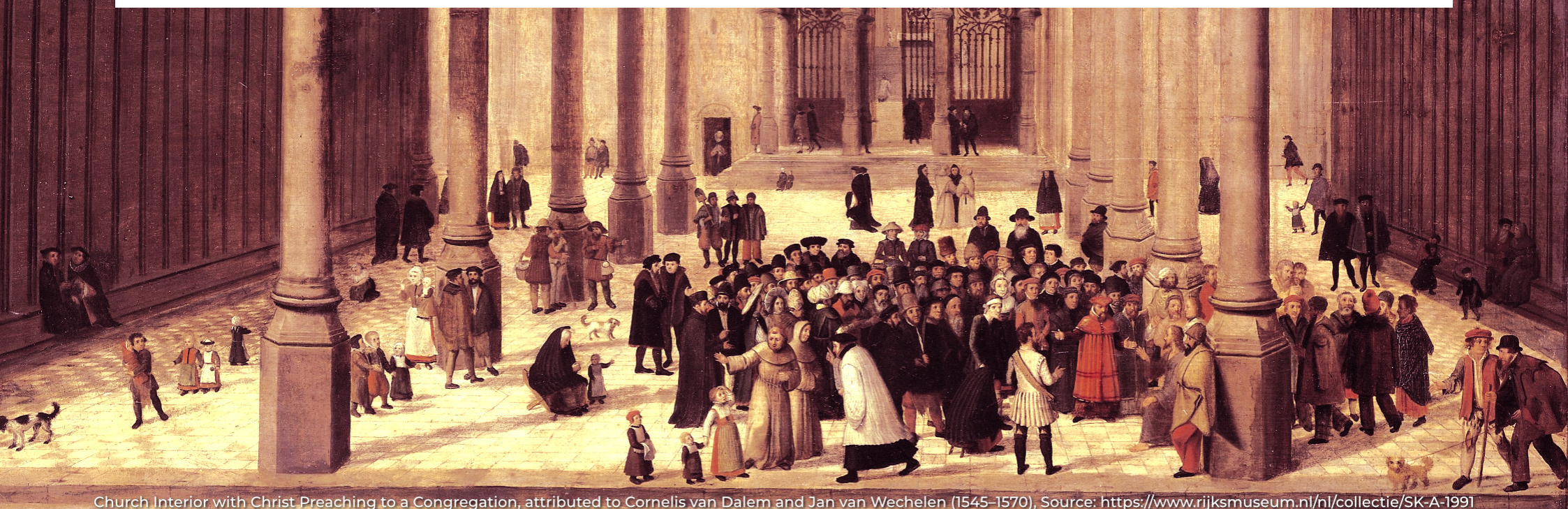
Church Interior with Christ Preaching to a Congregation, attributed to Cornelis van Dalem and Jan van Wechelen (1545–1570)