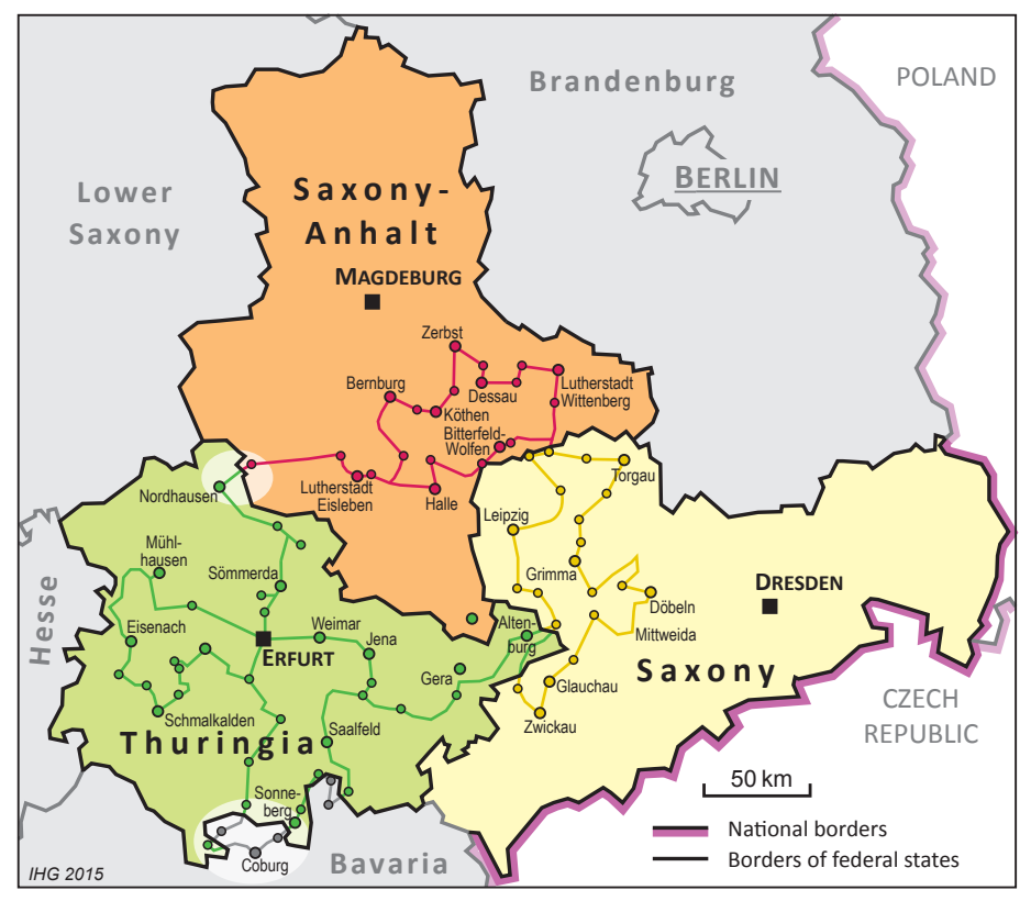
Fig. 3: Map discourse cultural routes

atic research has been carried out since 2002 into documents relating to Bach in all the archives and libraries of Central Germany. Another historic site related to Bach is the Bach House in Eisenach, the birthplace of Bach, which has been disseminating in-depth knowledge about his work and maintaining the composer's musical legacy. Opened in 1907, it was the world's first museum devoted to the musician and composer.