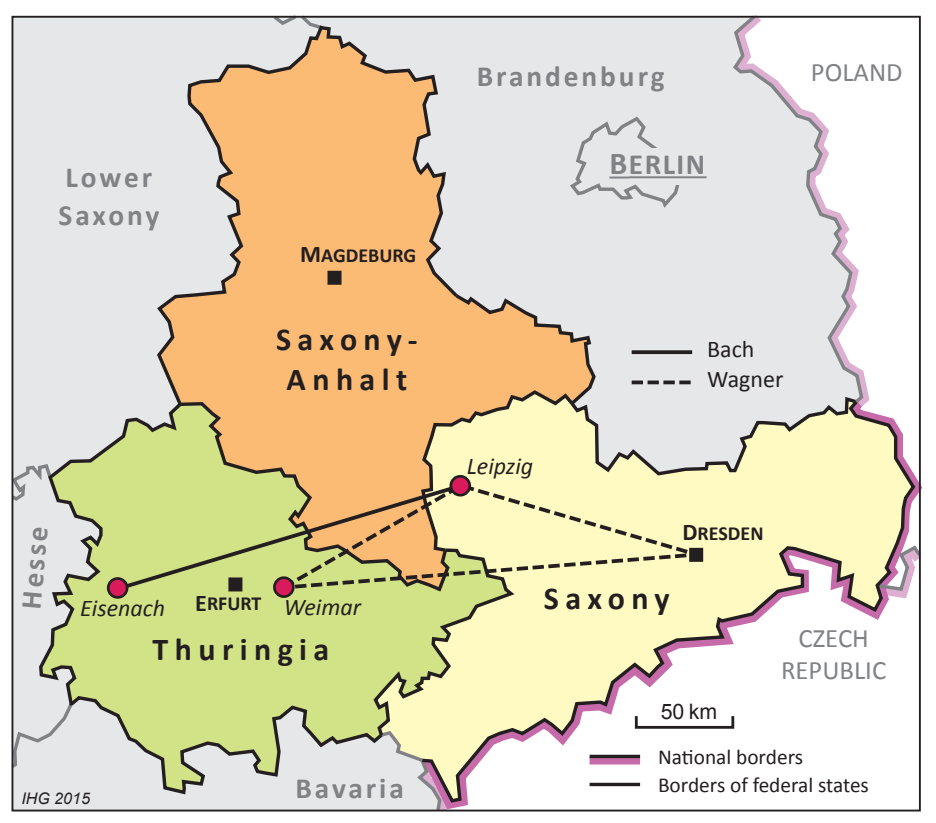
Fig. 4: Map discourse musical tradition