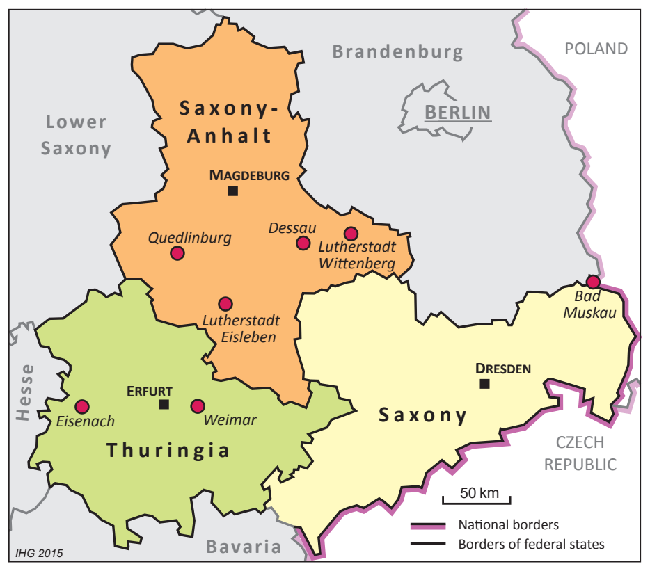
Fig. 2: Map discourse cultural heritage

In the year 1521 Martin Luther found refuge in the Wartburg, where he translated the New Testament into German. Three hundred years after the start of the Reformation, in 1817, 'Burschenschaft' student fraternities from all over Germany celebrated the Wartburg Festival in an early demonstration of German unity. In the nineteenth century the Wartburg was turned into a national monument and represents an architectural mixture of Romanesque, Gothic, Renaissance and Historicist influences. Highlights include the Romanesque Palas, a roofed hall built in 1155, which is today regarded as the bestpreserved secular Romanesque edifice in Northern Europe.