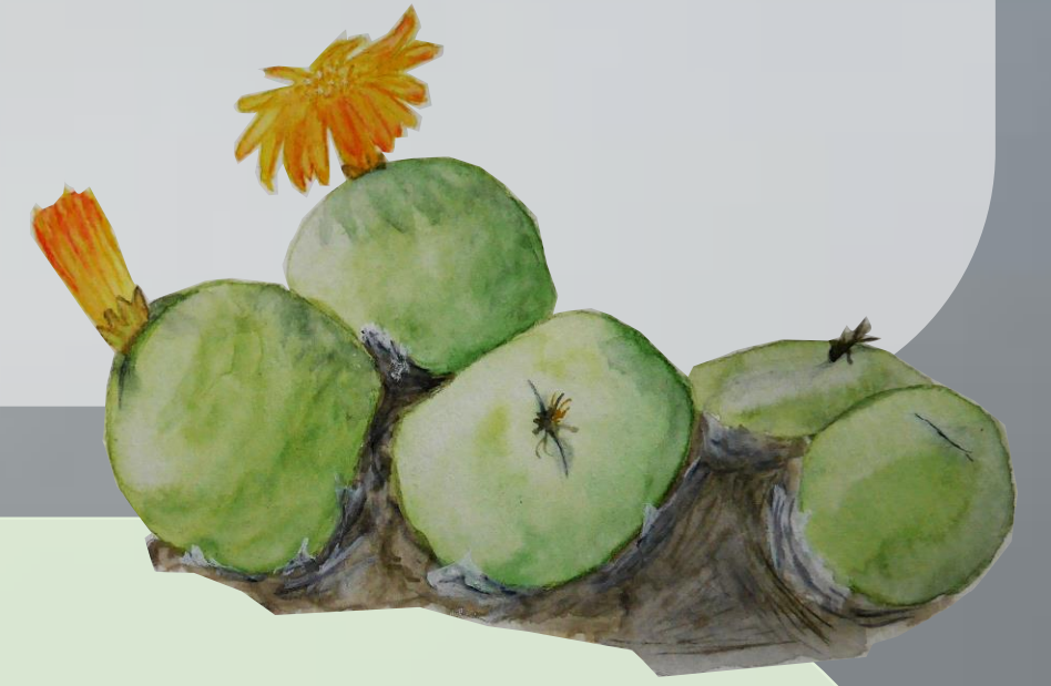
Conophytum calculus sub. calculus

2 Biodiversity, Evolution, and Ecology of Plants, Biocenter Klein Flottbek and Botanical Garden, University of Hamburg